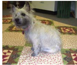
Now, do these seams look straight to you?

Oh Baby it's cold outside!! Lately I've had to dig to the back of the closet and get out the heavy duty warm coat and gloves. I love the snow, but don't like the cold much. I've had the desire to just curl up on the couch with burning fireplace, a quilt and a good book and forget going outside.